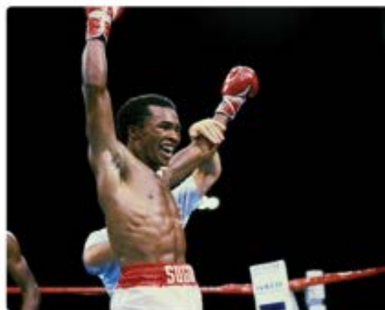
Leonard, shown here after defeating Thomas Hearns for the world welterweight championship in 1981, won boxing titles in five weight classes.

“It’s going to take all of us,” he says. “It’s not one person. Not two, not 20, not a thousand. The more we have, the better off we’ll become.” 🙌