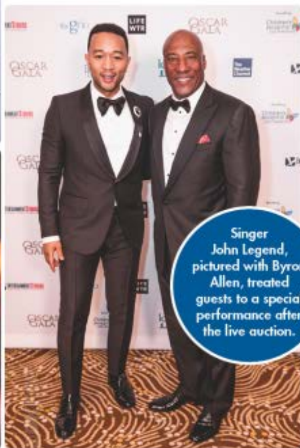
Singer John Legend, pictured with Byron Allen, treated guests to a special performance after the live auction.