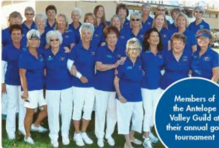
Members of the Antelope Valley Guild at their annual golf tournament