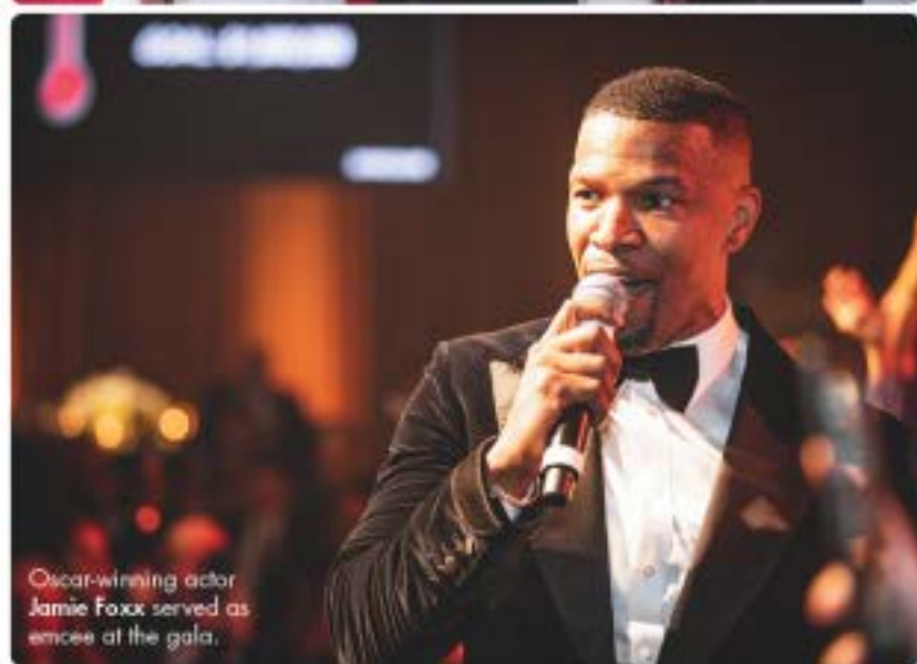
Oscar-winning actor Jamie Foxx served as emcee at the gala.