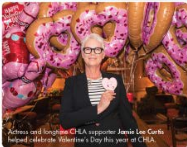
Actress and longtime CHLA supporter Jamie Lee Curtis helped celebrate Valentine's Day this year at CHLA.