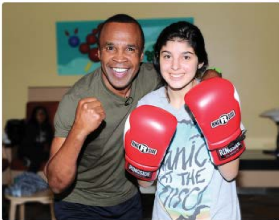
Still a model of fitness long after retiring from boxing, Leonard often leads a light workout for patients during his visits to CHLA.

“DIABETES WAS ALWAYS THE TARGET. THAT HAS BEEN MY FOCUS FROM DAY ONE, TRYING TO MAKE SURE KIDS HAVE A GREAT FUTURE. NOT JUST MY OWN KIDS, BUT OTHER KIDS.”